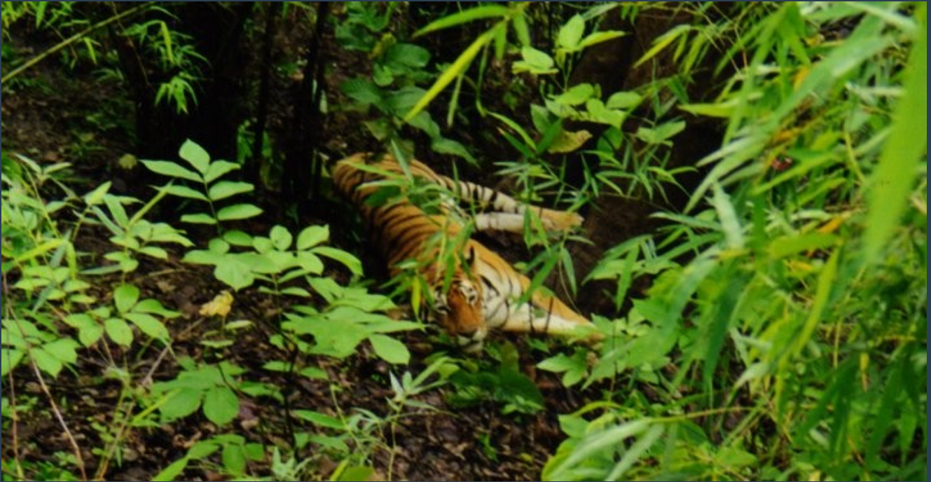
Tiger, Kanha Tiger Reserve